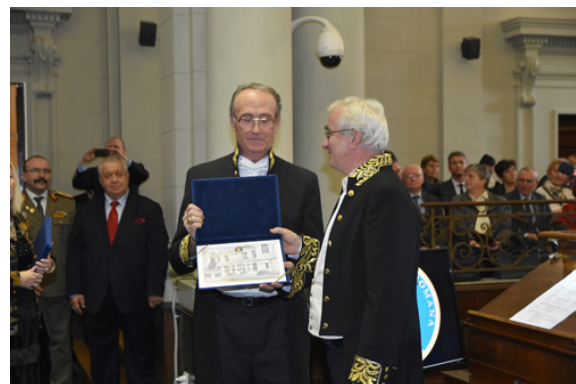
Date of award ceremony: December 15, 2017, at 10 am, Hall of the Romanian Academy, Bucharest Web: http://www.acad.ro/bdar/galeriiFoto/foto2017-1215St78.php

It is to remark that up to now, this monograph is present in more than 200 university libraries worldwide, according to the international catalog WorldCat ( www.worldcat.org ).